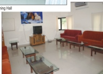
Comfortable Lobby at FTI