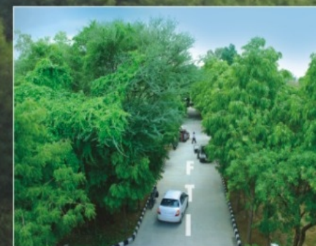
FTI marches ahead