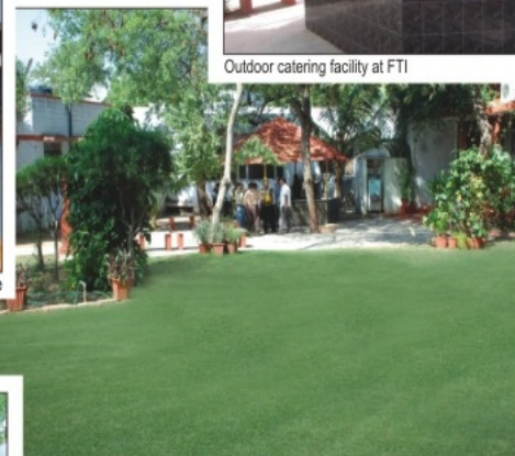
Luxuriant greens at FTI