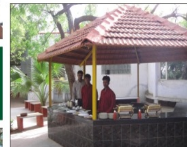
Outdoor catering facility at FTI