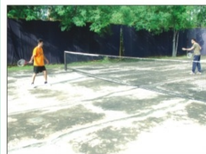
Stay fit while at FTI

"Far and away the best prize that life offers is the chance to work hard at work worth doing."