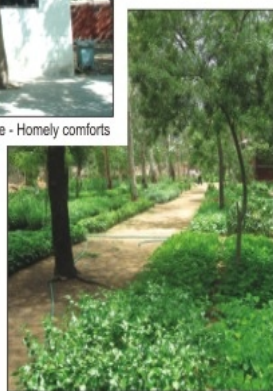
FTI's green bank