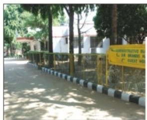
Well-marked signage at FTI