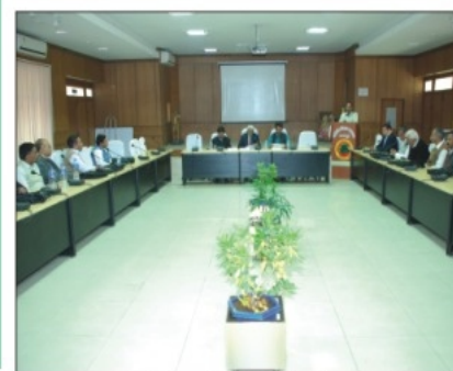
Sir Brandis Hall - A state-of-the-art Conference Hall