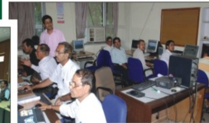
Computer Lab - Equipped with modern gadgetry