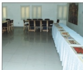
Spacious Dining Hall

The Institute at Jaipur consists of an Administrative Block, a spacious auditorium, a well-stocked Champions library, modern state-of-the-art classrooms and Sir Brandis conference hall, along with a fully equipped audio visual laboratory. The hostel, 'Chinkara' and mess facility is hygienic and comfortable. Tennis and badminton courts, table tennis, a reading room and television provide the hostel inmates with ample leisure activities. A beautiful lawn around the complex with an in-house nursery in the midst of sylvan surroundings completes the picture. The nursery serves as a centre for demonstration of nursery techniques and an outdoor classroom, while also providing saplings to plant lovers.