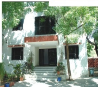
Guest House - Homely comforts